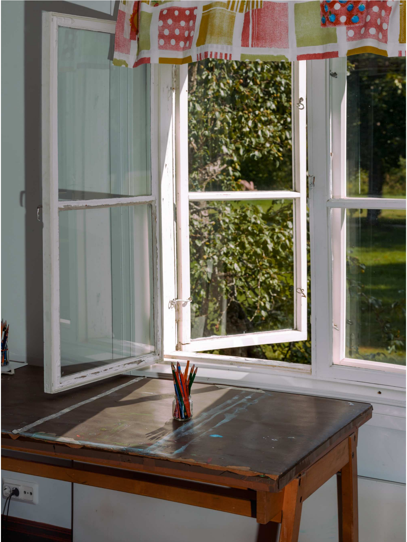
Penciling (In collaboration with the Valkeakoski Youth Art School), Archival Pigment Print, 30x40, 2013