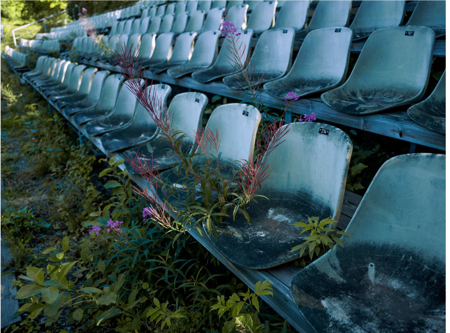
Tampere Seating , Archival Pigment Print, 30x40, 2013