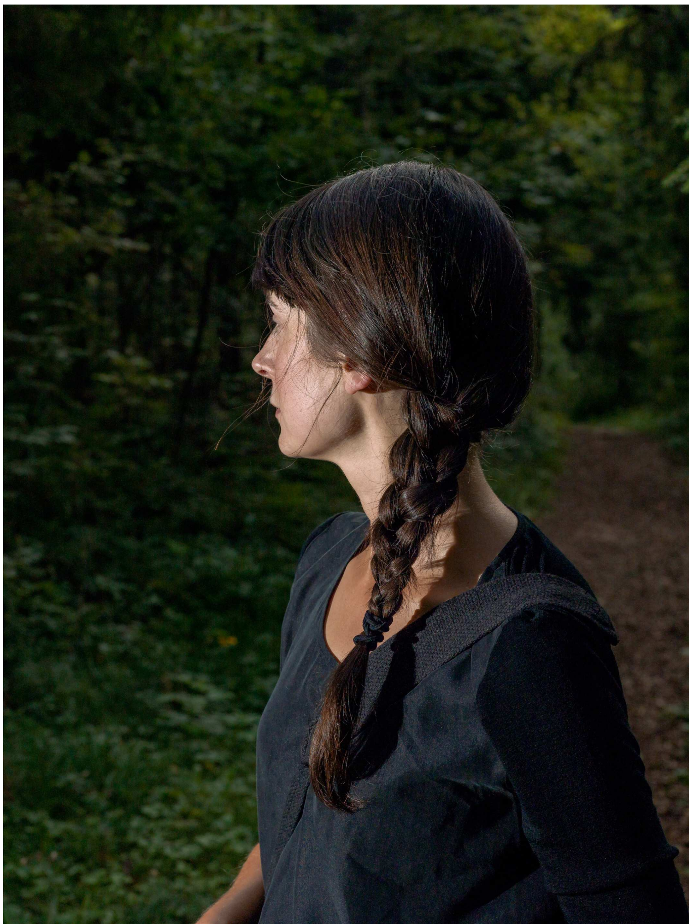
Clare , Archival Pigment Print, 24x30, 2013