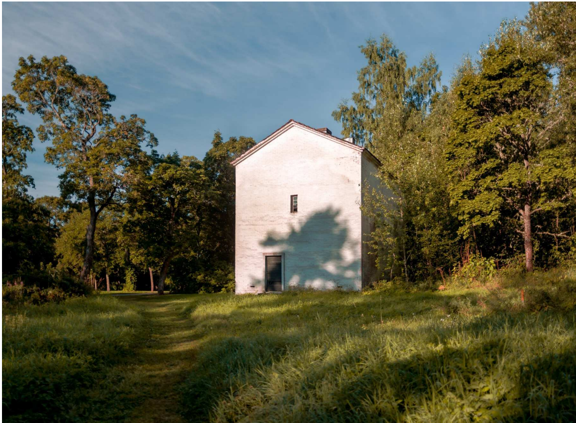
Above Image, Mushroom Map , Archival Pigment Print, 24x30, 2013 Lower Image, Structure (Voipaala) , Archival Pigment Print, 24x30, 2013