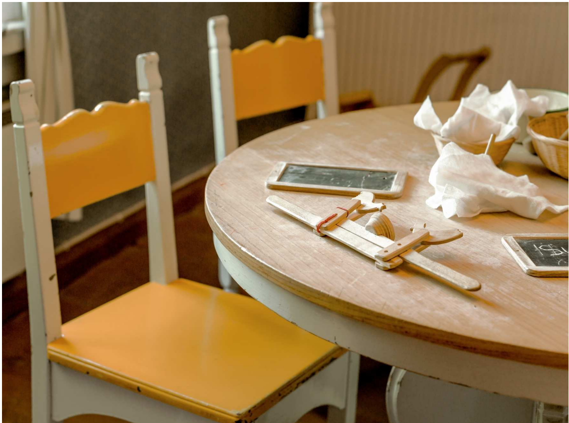
Above Image: Stir Sticks Drying , Archival Pigment Print, 24x30, 2013 Lower Image: Children's Work , Archival Pigment Print, 24x30, 2013