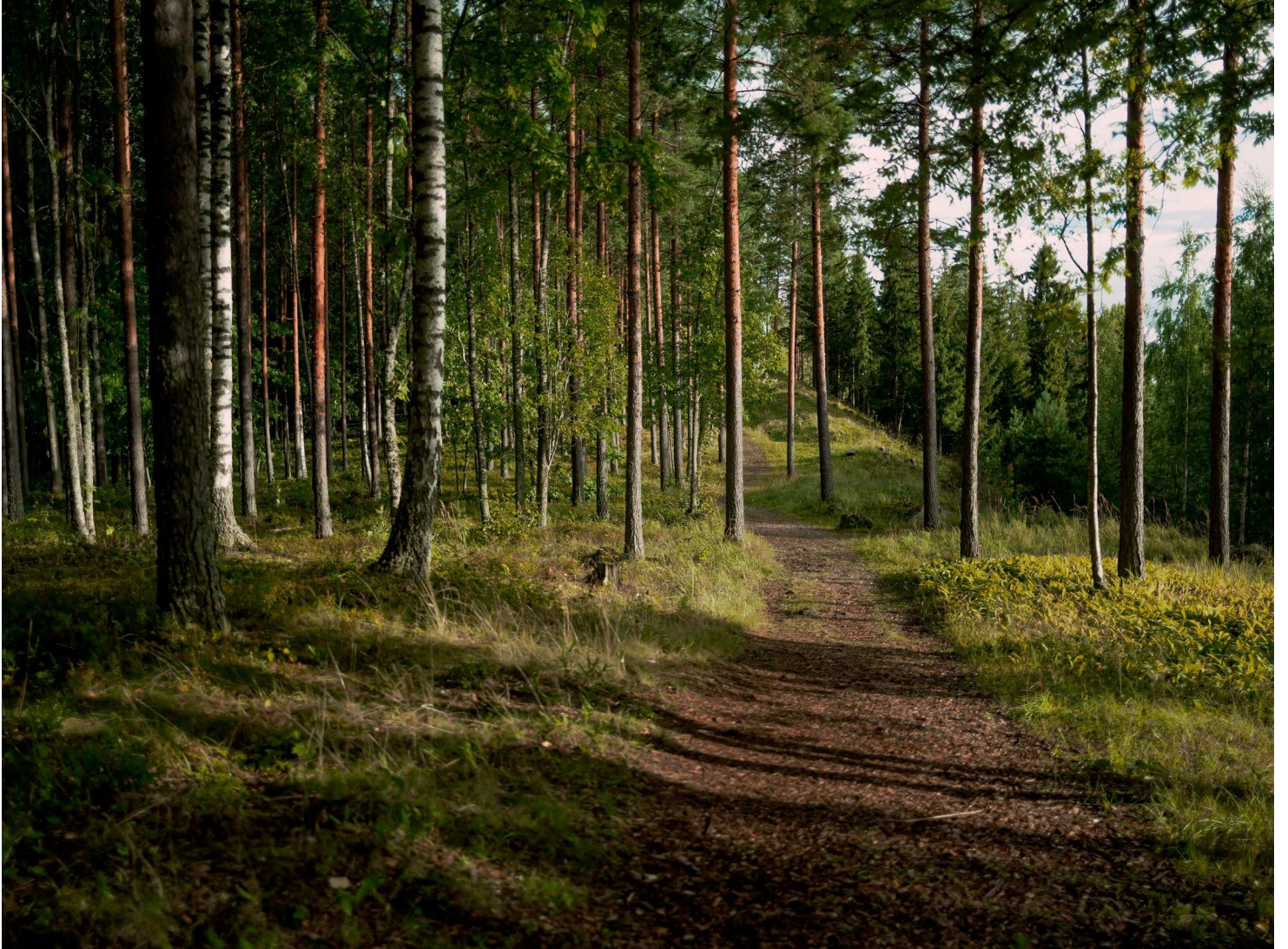
Jokamiehenoikeus , Archival Pigment Print, 30x40, 2013