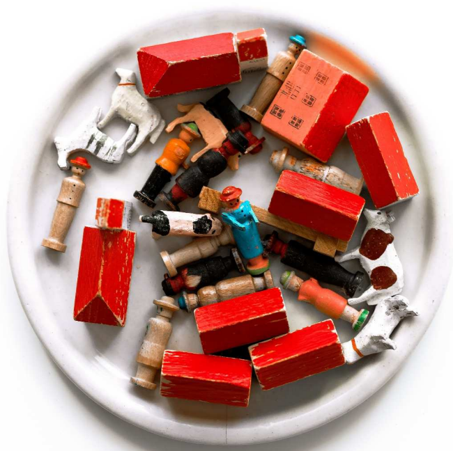
Childrens Toy's (Stockholm) Archival Pigment Print, 24x30, 2013