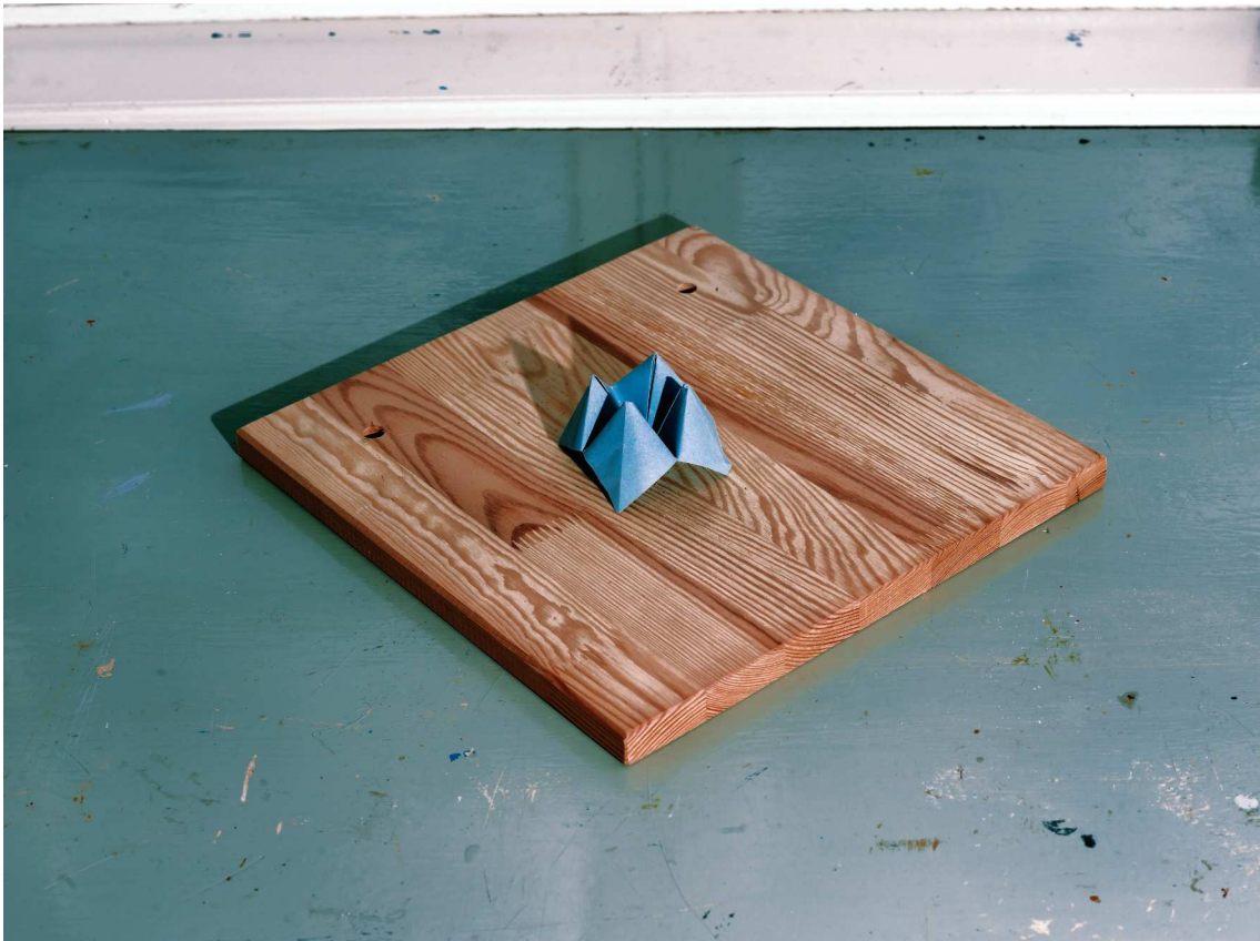
Above Image, Lookout (Lake Pyhäjärvi), Archival Pigment Print, 24x30, 2013 Lower Image, Triangulating Archival Pigment Print, 24x30, 2013