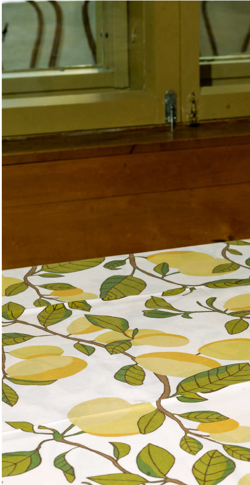
The Simulacrum of Apples , Archival Pigment Print, 30x40, 2013