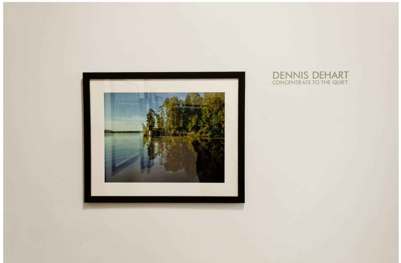
Installation Views, Spot Photo Works , Los Angeles, August, 2014. The solo show included 22 archival pigment prints ranging in size from 11"x14" to 30"x40".